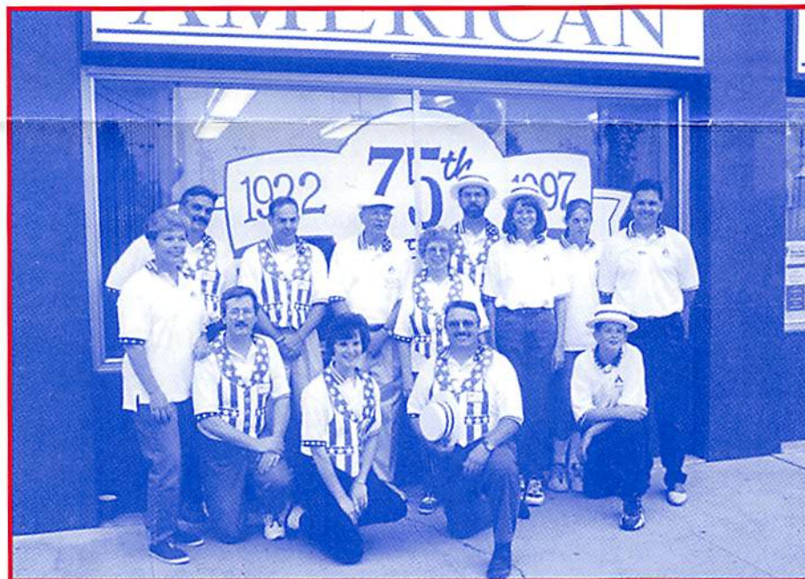
Sullivans' and staff pose for posterity.