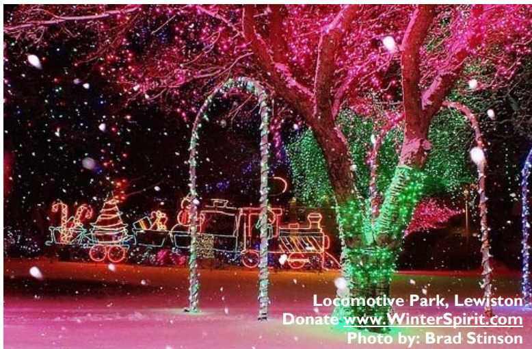
Locomotive Park, Lewiston Donate www.WinterSpirit.com