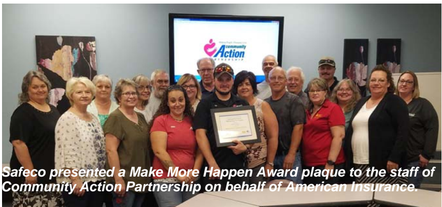
Safeco presented a Make More Happen Award plaque to the staff of Community Action Partnership on behalf of American Insurance.

(continued from Page 1 – FOOD BANK GRANT) Safeco offered to double the original $5,000 grant through a social media campaign to help bring more awareness to the good work and needs of our local food banks. You responded with more than 200 likes, comments and shares that secured the additional $5,000 award for a total grant of $10,000 to the CAP Food Banks.